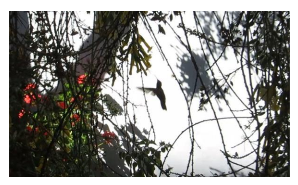
Sometimes the hummingbird converts itself into its own shadow