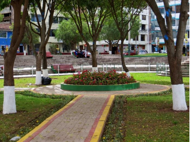
Direct link to reserve: <a href="https://www.airbnb.com.pe/rooms/11718184?">https://www.airbnb.com.pe/rooms/11718184?</a>

You can have a look into our city quarter and see more pictures via the above-mentioned links in the Airbnb website.