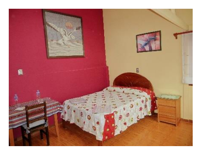
Link to reservation (Ctrl+click): https://www.airbnb.com.pe/ro11677553oms/?

Next to these guest rooms, there is a common room with a well-equipped kitchenette for exclusive use by individual or group guests. According to your preference, you can cook meals and prepare breakfast here.