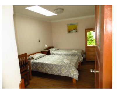
Direct link to reserve: https://www.airbnb.com.pe/rooms/15359282