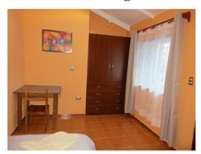
Link to reservation (Ctrl+click): https://www.airbnb.com.pe/rooms/11697840?