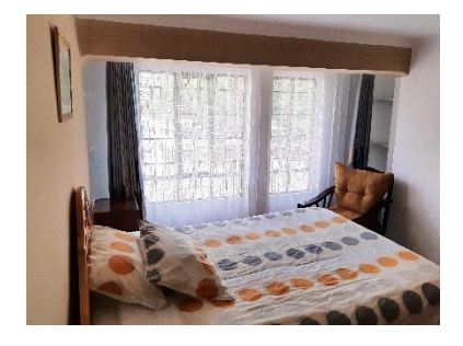
Link to reservation (Ctrl+click): https://www.airbnb.com.pe/rooms/11084710?