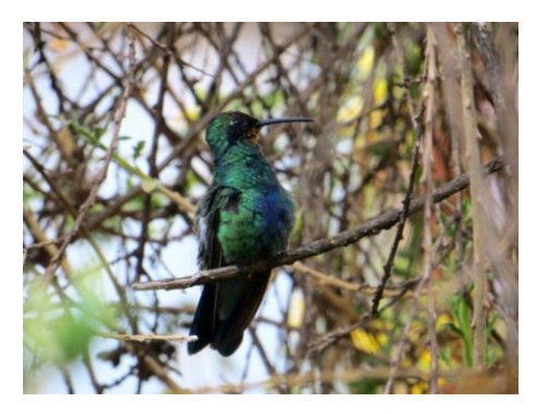
When still on a branch, it is easier to take a photograph of the hummingbird