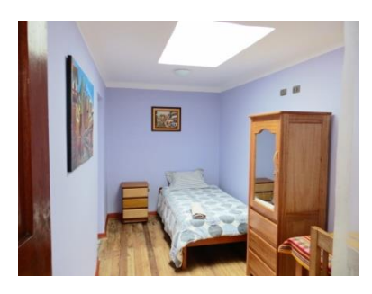
Direct link to reserve: <a href="https://www.airbnb.com.pe/rooms/15600707?">https://www.airbnb.com.pe/rooms/15600707?</a>

You will enjoy the tranquility of our patio. From July on, the Khantu tree (Cantua buxifolia) starts blooming; at any moment of the day, but especially in the morning hours, hummingbirds honor us with their visit.